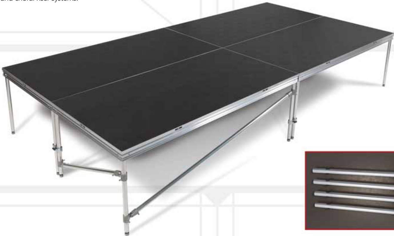
SC90 Platforms with Leg Supports, Bracing, and Leg Clamps

Our SC90 Leg Supports, used with the SC90 and SC97 Platforms, guarantee maximum durability and strength; the leg supports feature the same high quality aluminum that is used on our platforms. The leg supports are available in both fixed and adjustable heights, and have bracing and leg clamps available for extra stability and rigidity at higher elevations. In addition, our leg supports can be used with the most challenging custom applications on stages, seating, and choral riser systems.