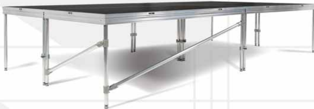
Detailed View of SC90 Leg Supports, Bracing, and Leg Clamps