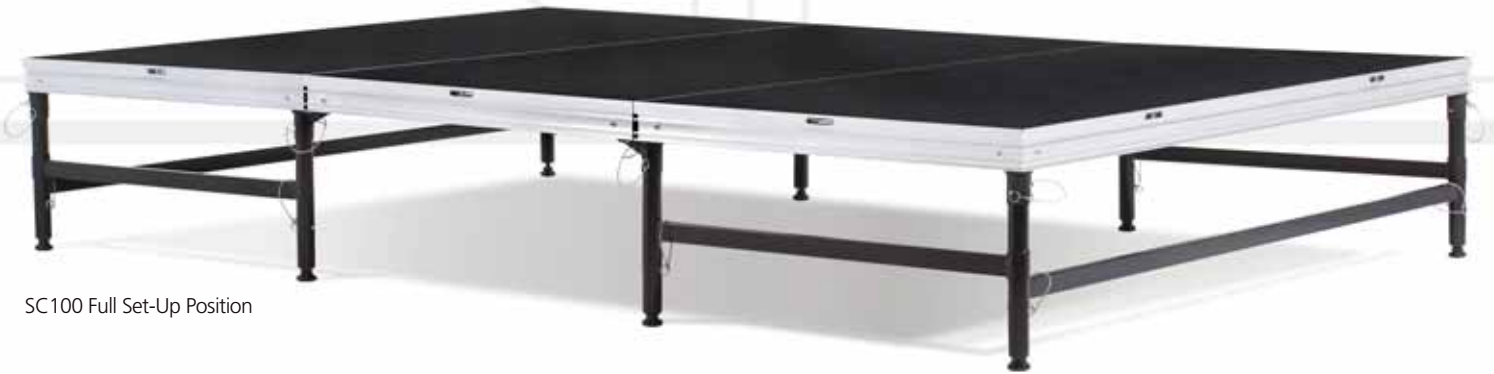
SC100 Full Set-Up Position

The SC100 Folding Bridge Frame, also referred to as a C-frame, is a functional frame that allows bridging between platforms, saving valuable setup time. The frame, which is available in fixed and adjustable heights, folds flat and is self-contained. Custom sizes are available and allow you to use the SC100 with the SC90 Single Side Platform or the SC97 All-Aluminum Platform.