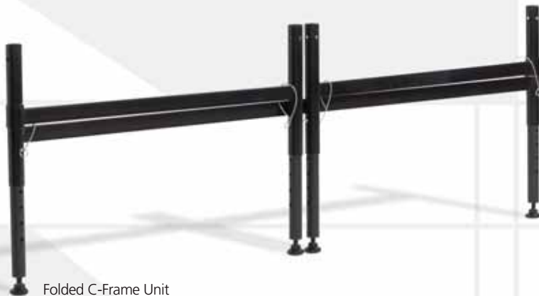
Folded C-Frame Unit