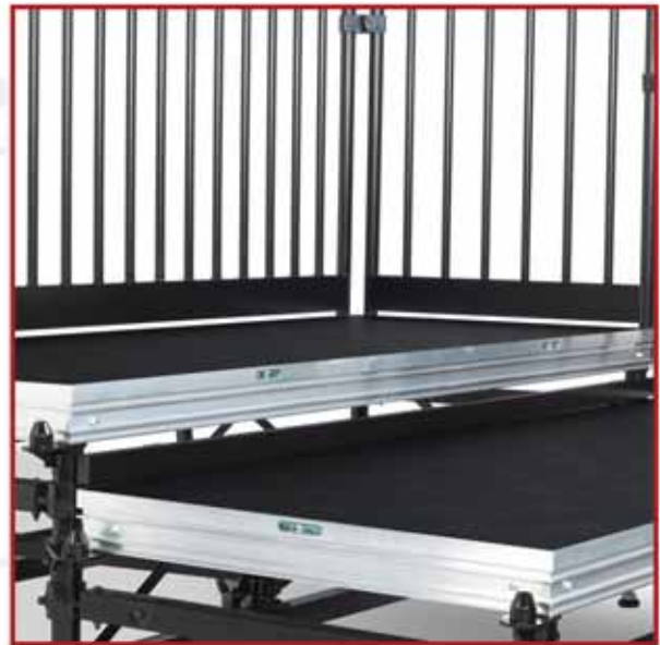
Detailed View of Chair Stop