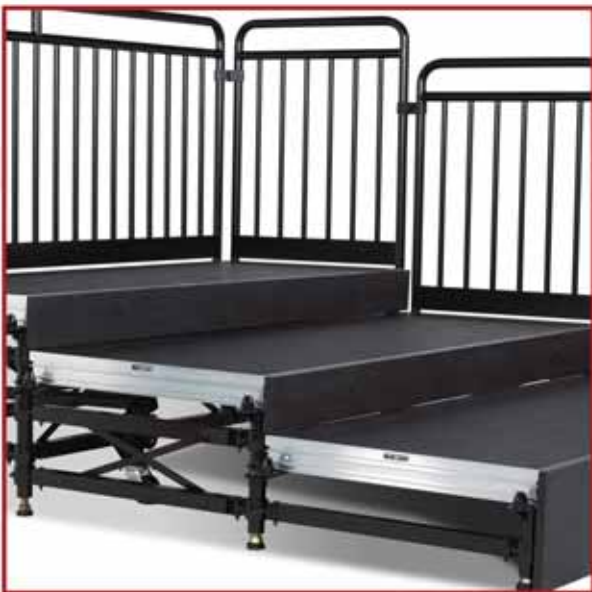
Detailed View of Closure Panels