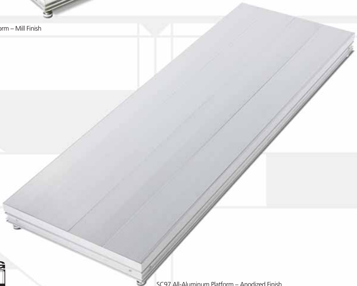
SC97 All-Aluminum Platform – Anodized Finish