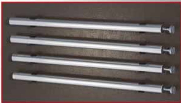
SC90 Underside's Built-in Leg Storage