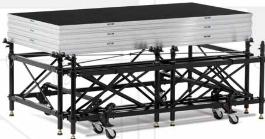
Multi-Functional Support Frame Used as Platform Storage Cart