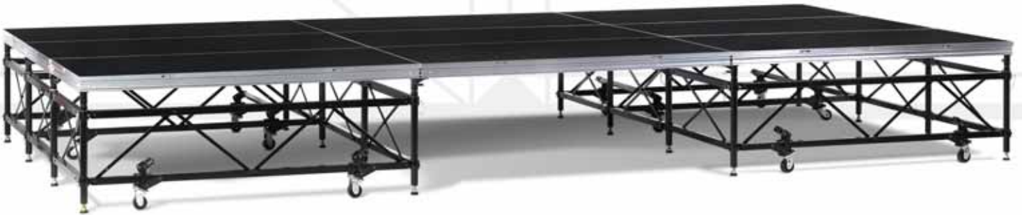
SC2003 Rolling Stage with Bridged Platforms

The SC2003 Rolling Stage has a retractable caster assembly to easily roll across a flat floor when completely assembled. The stage consists of a support structure and three 4'x8' SC90 Platforms, creating an 8'x12' area. Multiple rolling stages can bridge SC90 Platforms to create a larger performance area. When not in use, the support frames can be used as a platform storage cart (pictured below).