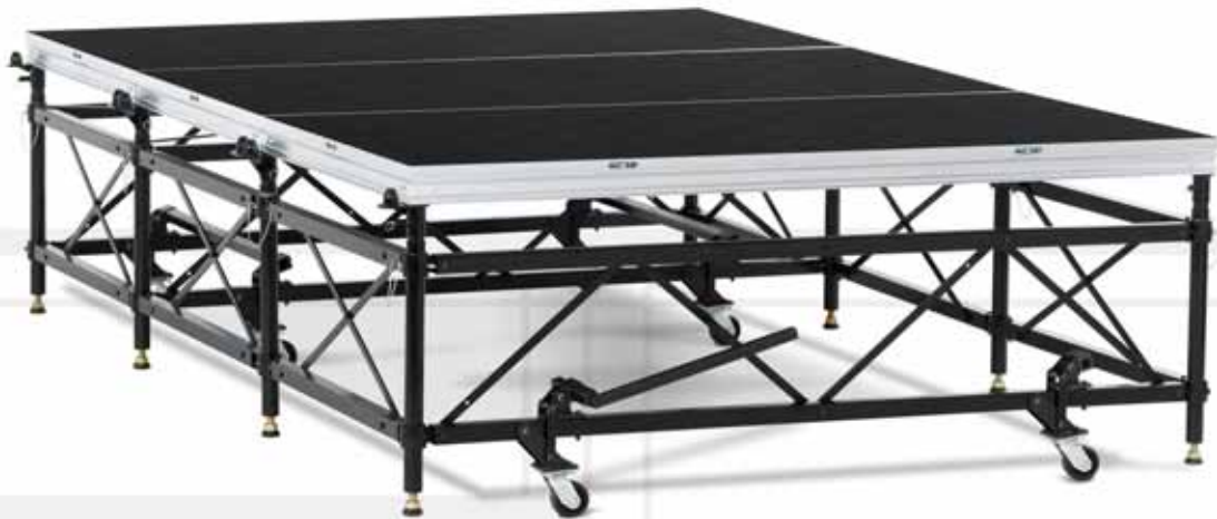
SC2003 Rolling Stage – 8' x 12'