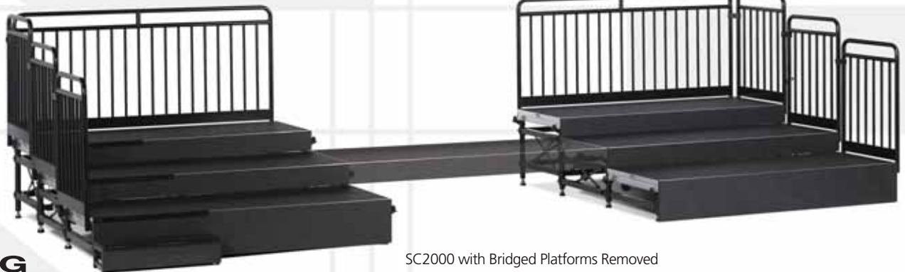
SC2000 with Bridged Platforms Removed