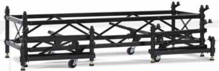
SC2000 Understructure – Folded Position