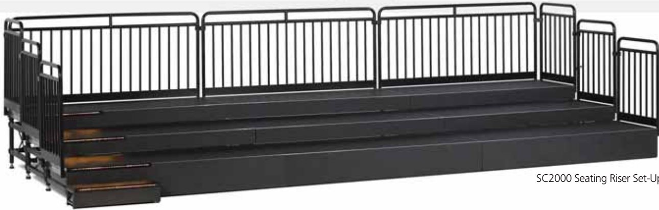
SC2000 Seating Riser Set-Up

The key features of the SC2000 are its quick setup, flexible configurations, and compact storage. The understructure unfolds like an accordion and expands to fill the designated space. Only two people are required for setup and custom sizes are available to fit into even the most unusual spaces. Should you need less or no seating at all, the SC2000 folds into 15% of its expanded size and easily rolls away on retractable casters for storage.