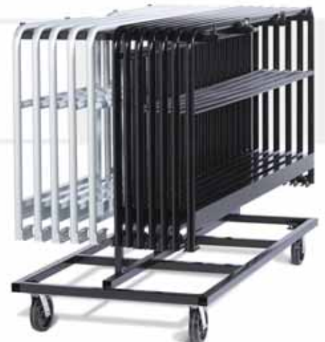
Guardrail Storage Cart