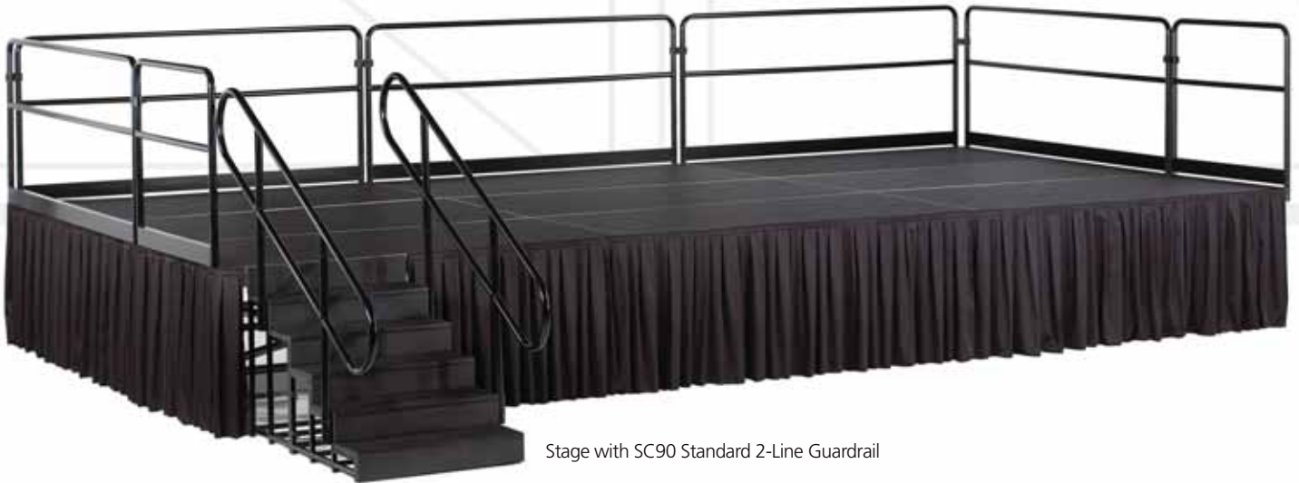
Stage with SC90 Standard 2-Line Guardrail

To ensure safety, Staging Concepts manufactures two styles of guardrail: standard 2-line and IBC (International Building Code) compliant guardrail. Both guardrails securely lock to the platforms. Customized styles are available upon request.