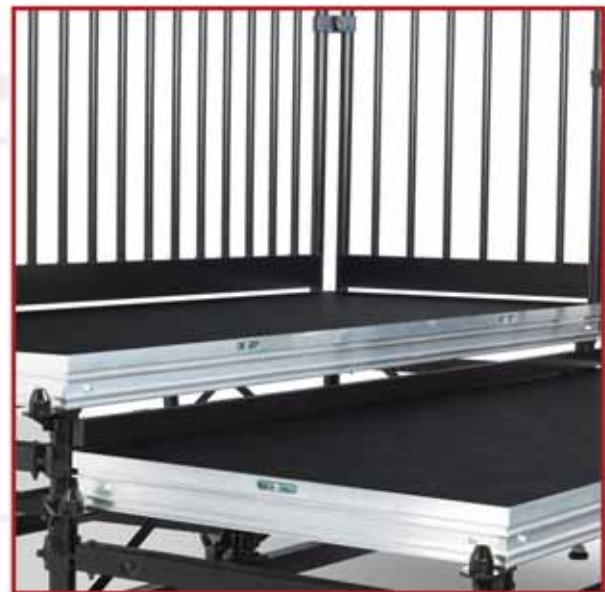
Detailed View of Chair Stop