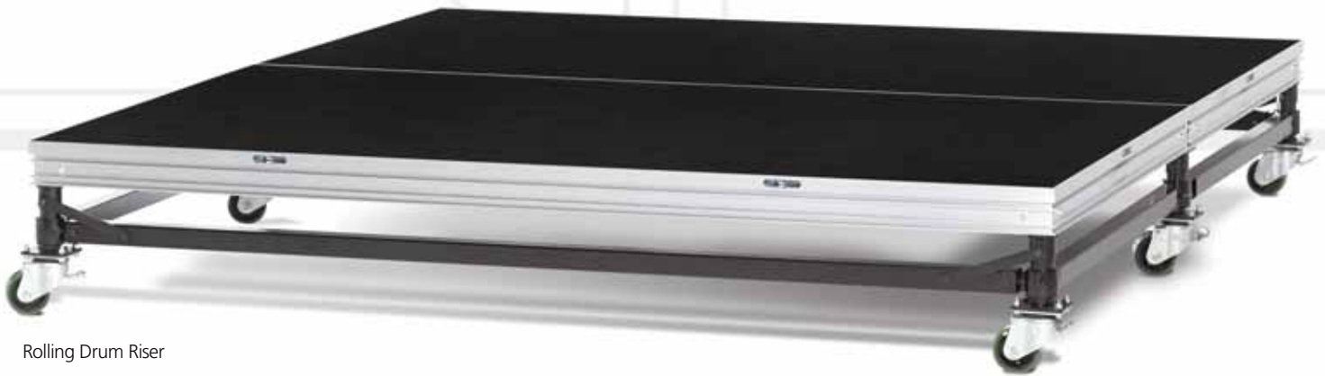
Rolling Drum Riser

Staging Concepts' Rolling Drum Riser complements your performance stage set-up. Its understructure has dual locking casters to keep the riser in place during performances. When not in use, its understructure collapses for easy storage and transport. The Rolling Drum Riser is for use with SC90 Platforms.