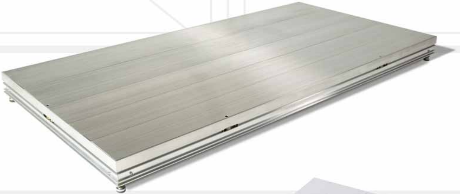
SC97 All-Aluminum Platform – Mill Finish

The SC97 Platform is an all-aluminum weatherproof deck used mainly in sports stadiums and arenas. It is engineered for strength and durability, and is lightweight. All decking and aisle steps are made of non-slip ribbed extruded aluminum. The SC97 is flexible and can be used with all Staging Concepts' supports.