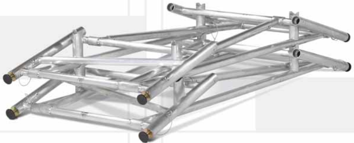
SC9600 Collapsible Bridge Support – Collapsed and Stacked